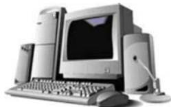
PERSONAL COMPUTER .01 -.02/ HOUR