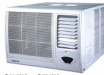
WINDOW AIR CONDITIONER .18 -.33 / HOUR