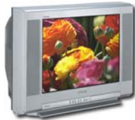
COLOR T.V. .02-.06/HOUR