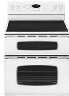
ELECTRIC OVEN .16/HOUR