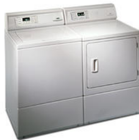
WASHER .03-.07/LOAD DRYER .67/LOAD